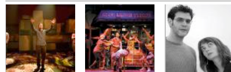
This Beautiful City In the Heights Chekhov 101